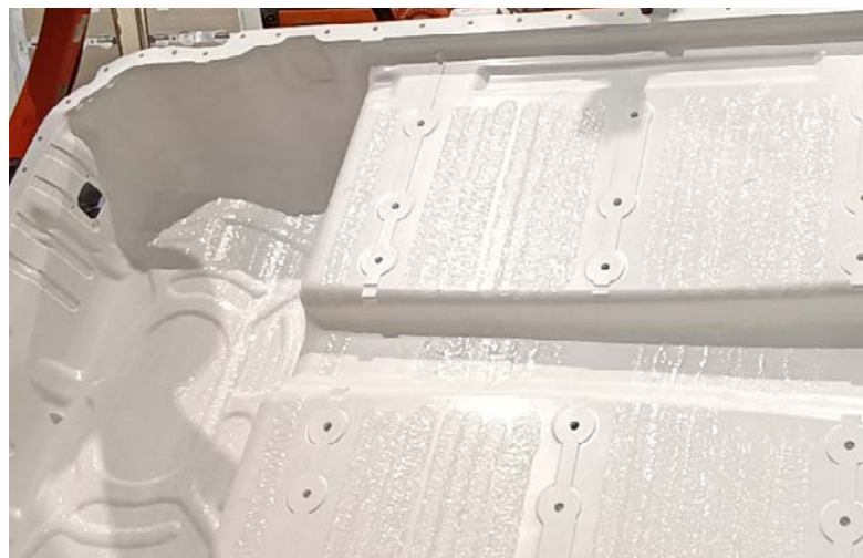
Precision, repeatability, and edge accuracy are hallmarks of quality in swirl application