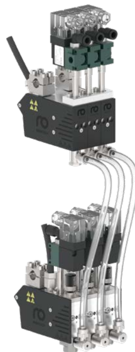
The Areo application head delivers precise, repeatable swirl application of high edge accuracy